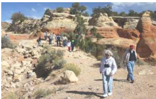
Starting Down the Trail to the Mica Mine (50 hiked)