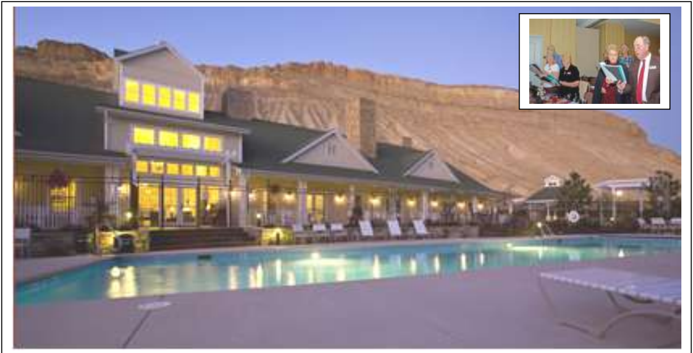
The inner courtyard of the Wine Country Inn at dusk. The Meeting Room is in the wing to the right of the center of the photo.