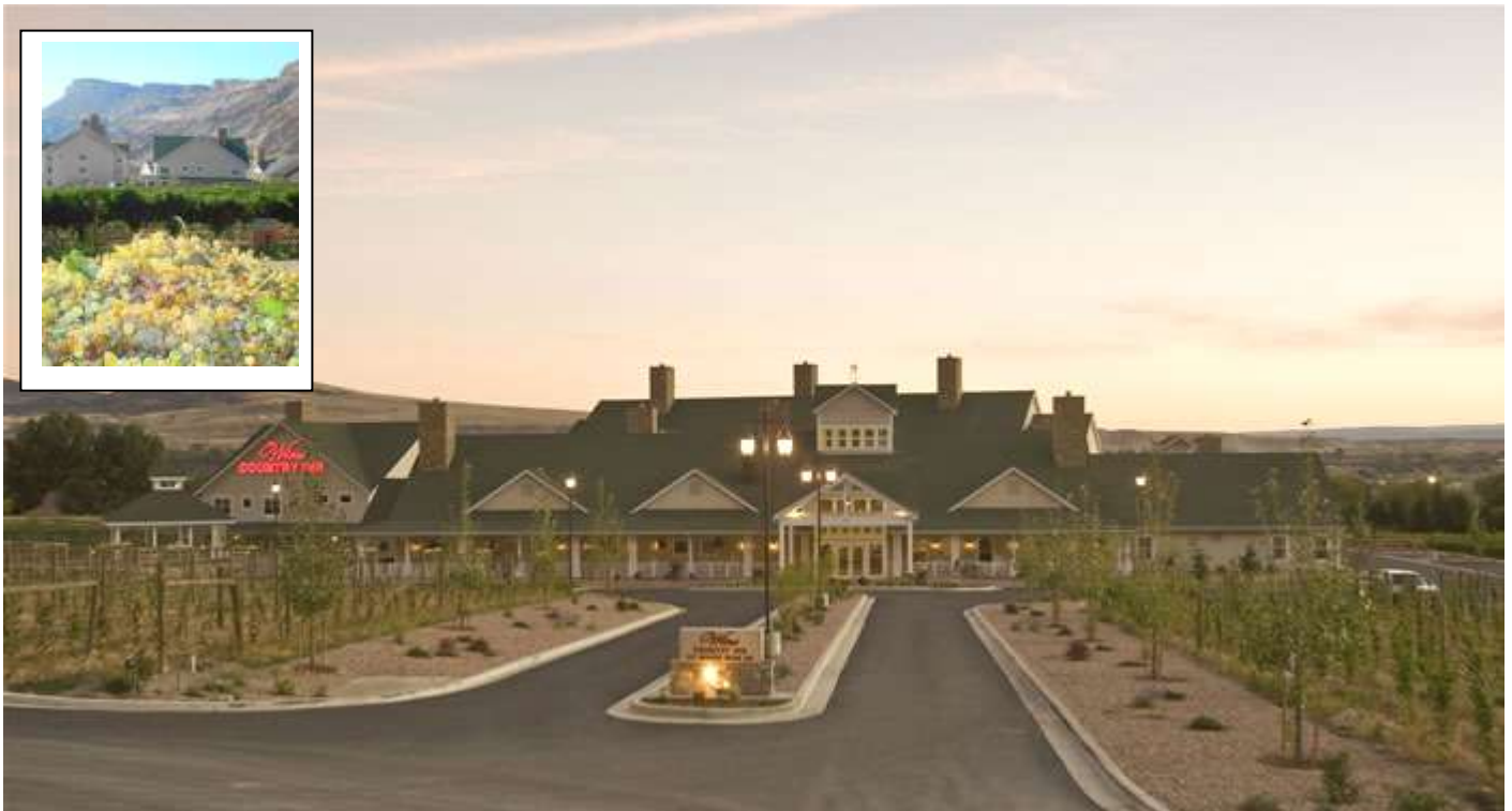
The Wine Country Inn in Palisade, as you enter from Interstate Highway 70. Acres of vineyards surround the site.