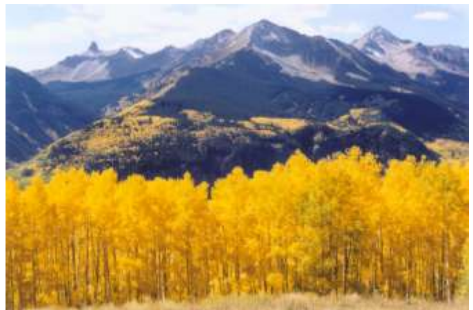
Fall colors accentuate many southwest mountains scenes, this particular one is in the Alta Lakes region.

The Feast begins with an 'opening night' service the evening before the first day. Services are held in the mornings of each day, with a variety of speakers, leaving afternoons open for any number of private and organized group activities. One day during the week is dedicated to a fellowship or family day activity, open to all attendees. In 2009, there were interactive Bible Studies, a Seniors Luncheon, group hikes, a bus trip to Glenwood Springs to enjoy its many unique activities, and a Formal Banquet with live entertainment and dancing.