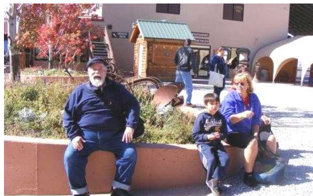
Gathering at the Summit House to start the many activities: Cave Tours, Alpine Slide, Paintball, Amusement Rides, etc.