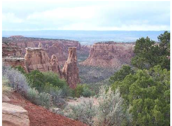
Forming the west side of the Grand Valley is the Colorado National Monument providing many square miles of eroded natural beauty, with a scenic drive on the rim and trails within. The CNM is less than a half hour drive from Palisade.