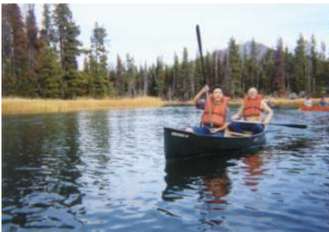
Wettin' a paddle on a high mountain lake. There are trails and a large number of lakes just like this up on the 10,000 foot high Grand Mesa, about 45-minutes from the Site. In these crystal clear waters, you can see all the trout swimming by.