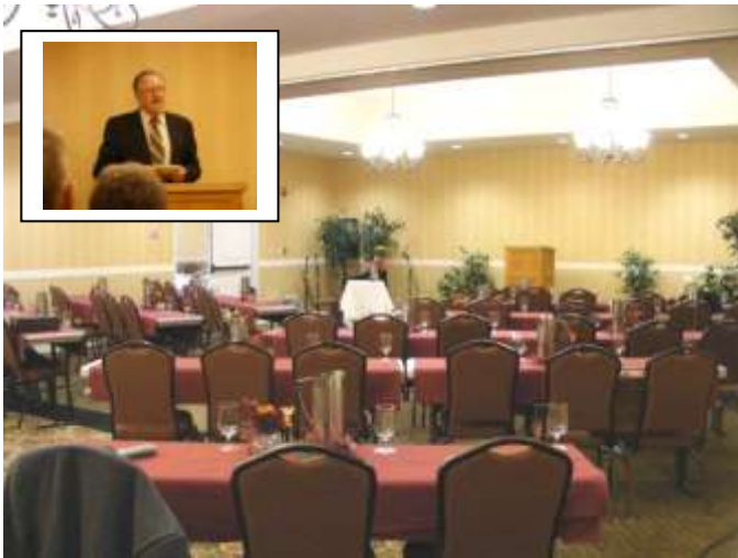
The Meeting Facility with Seminar Type Setup