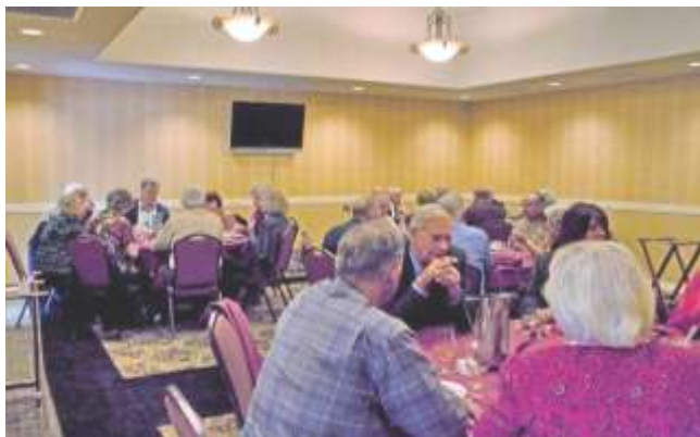
Enjoying the Seniors' Luncheon (36 attended)