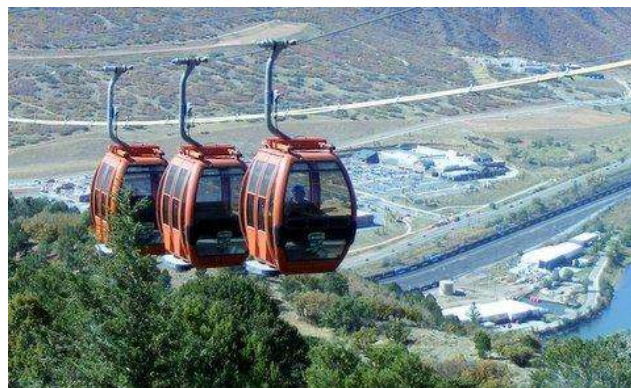
Tram Cars ascending Iron Mountain in Glenwood Springs