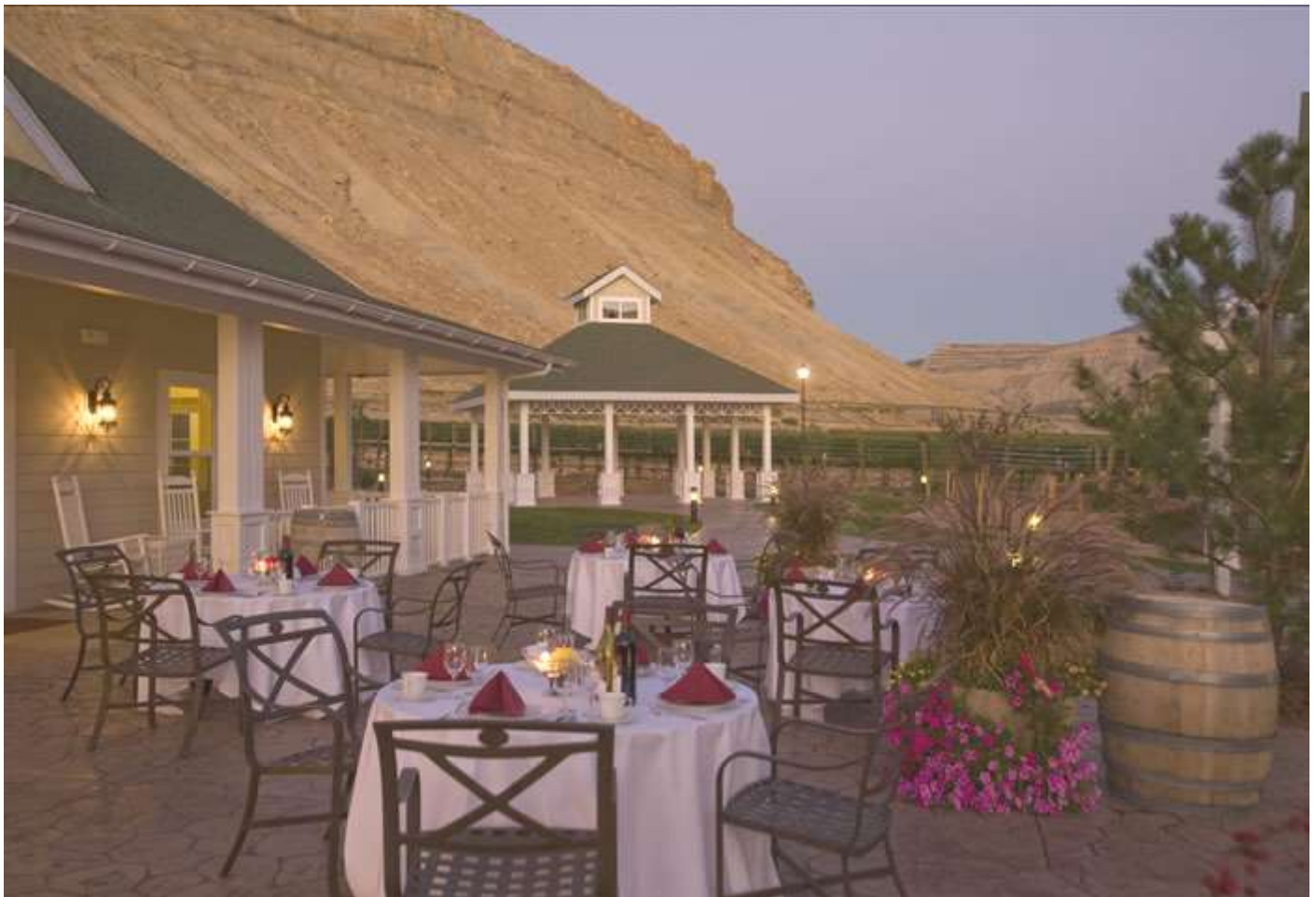
In the Courtyard, set for an evening banquet. The Palisade Cliffs rise to the left with vineyards beyond the Pavilion.