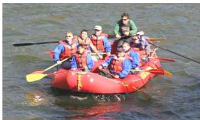
Guided Raft Trip thru Glenwood Canyon (16 participated)