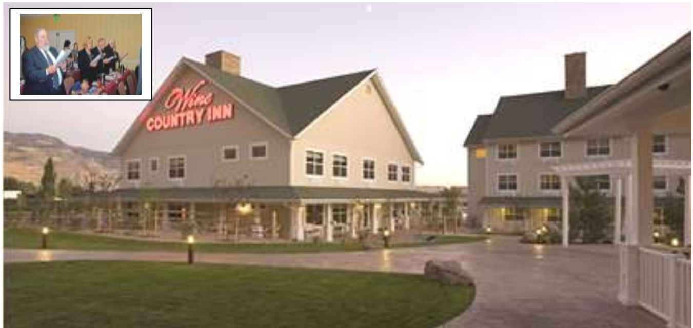
Another of the buildings at the Inn. The Meeting Facility is just to the near right in this view. Three stories of accommodations are in the long building across the way. Except for this separate building on the left, all spaces are connected internally.