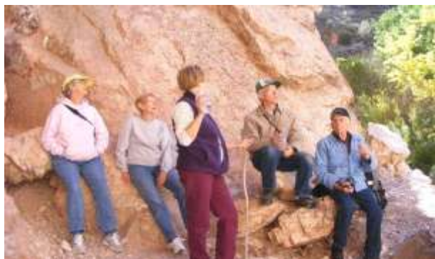
Taking a well deserved break at the Mine Entrance