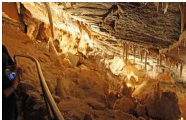
Inside Glenwood Caverns on Iron Mountain