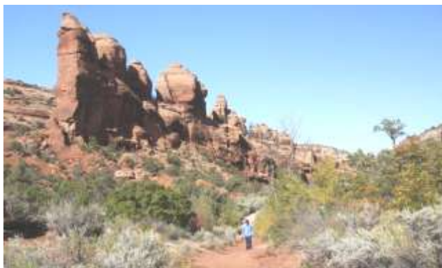
Scenery along the Mica Mine Canyon Trail